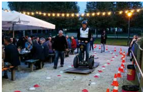
Exhibition and evening events will bring experts and visitors together.